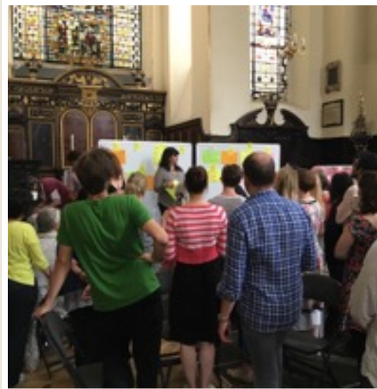
Chaordic design cafe