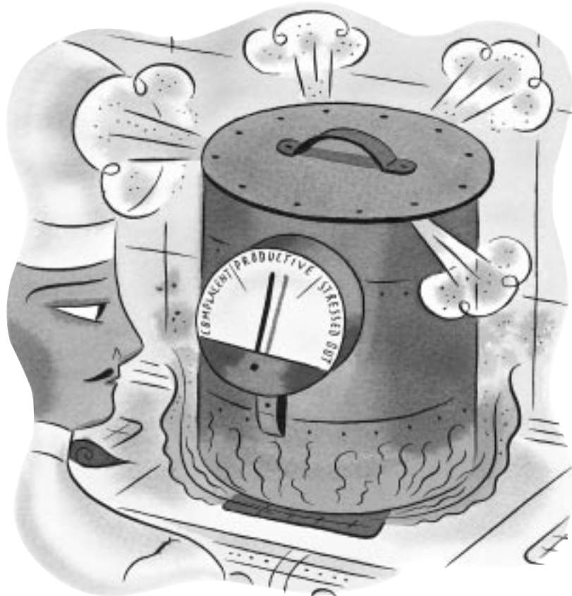
Leaders must turn up the heat while also allowing some steam to escape.

Second, a leader is responsible for direction, protection, orientation, managing conflict, and shaping norms. (See the table "Adaptive Work Calls for Leadership.") Fulfilling these responsibilities is also important for a manager in technical or routine situations. But a leader engaged in adaptive work uses his authority to fulfill them differently. A leader provides direction by identifying the organization's adaptive challenge and framing the key questions and issues. A leader protects people by managing the rate of change. A leader orients people to new roles and responsibilities by clarifying business realities and key values. A leader helps expose conflict, viewing it as the engine of creativity